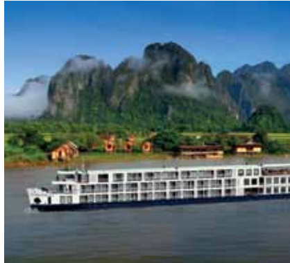
Pre and post cruising touring available in Saigon and Siem Reap

8 day Mekong River cruise on the brand new ship RV Amalotus. Escape summer and enjoy cooler temperatures in Vietnam and Cambodia in its dry spring season. See tropical plants flower and thriving village life on the Mekong River, a nautical highway from Laos to Vietnam. Explore floating markets & fishing villages, a silk weaving village, French Colonial buildings, Phnom Penh and learn more about the atrocities of Pol Pot's regime and the notorious Killing Fields. History, cultural immersion and exotic plants and flowers are an integral part of this unique cruise. Learn about tropical plants from special Guest Lecturer and Botanical Guide, Ross McKinnon, curator of the Brisbane Botanic Gardens. Ross' engaging personality and incredible plant knowledge will expand your