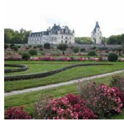
Discovery of France and Italy in spring - landscapes of Provence and Tuscany plus grand European Gardens