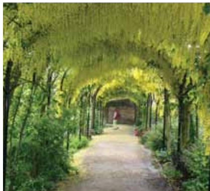
Combine your cruise with a visit to the Chelsea Flower Show or Cornwall Gardens

11 day cruise exploring gardens & history in Scotland, Ireland, Wales and Isle of Scilly the group and deliver lectures on the birdlife of the British Isles. Tony Musgrove will be your Botanical Guide. Departing: 24 May 2013 from Edinburgh For details ask for a 2013 Boutique Small Ship Cruising brochure. This normally inaccessible area has spectacular scenery, rugged coastlines and very ancient history. Feel like an intrepid explorer by day with easy access to magnificent sightseeing, then return to your floating ship with all its modern day comforts every evening. Enjoy unique bird spotting opportunities, with a special ornithologist on board to escort